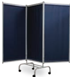
Model 3170-17 shown

Unlike similar style aluminum models the Privess™ Basic 3-Panel Privacy screen offers portable, high-quality steel framed privacy protection in a value priced package. Imported (Taiwan).