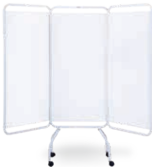
Model 3130 shown