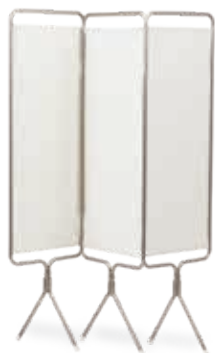
Model 3730 shown

Privess™ Elite showcases significantly upgraded durability and flexibility unlike imported lightweight models with a thin sheet of vinyl. The perfect solution for healthcare institutions, surgery centers, physician offices, and clinics where stylish substantial privacy screens are desired. Made in USA.