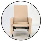
Push Back Recline