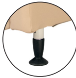
Pedestal Feet or 3” Casters