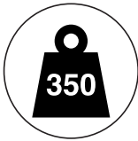
350 lb. Weight Capacity