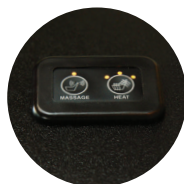
Heat + Massage