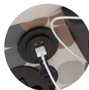
USB charging port