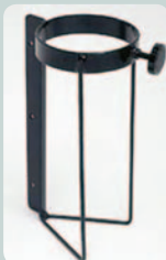
O 2 tank holder

Suggested recliner configuration based on most popular features and options for this application at time of printing. Many features and options available. See your Champion representative for more information. Champion reserves the right to make changes without notice in design specifications and models.