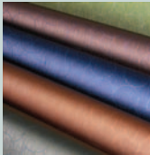
Soft, medical grade vinyl