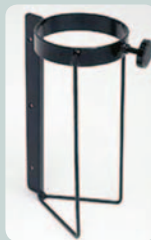
O 2 tank holder

Suggested recliner configuration based on most popular features and options for this application at time of printing. Many features and options available. See your Champion representative for more information. Champion reserves the right to make changes without notice in design specifications and models.