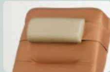
Head pillow/ Lumbar support