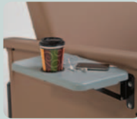
2nd fold-away side table w/cup holder