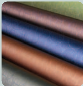
Soft, medical grade vinyl