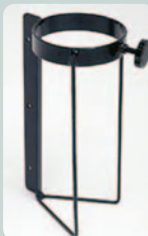
O 2 tank holder

Suggested recliner configuration based on most popular features and options for this application at time of printing. Many features and options available. See your Champion representative for more information. Champion reserves the right to make changes without notice in design specifications and models.