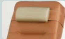
Head pillow/ Lumbar support