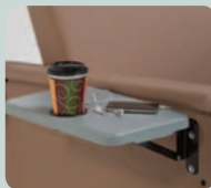
2nd fold-away side table w/cup holder