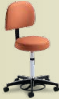
Caregiver Clinic Stool with optional backrest*

Champion's Caregiver Clinic Stool fills your need for an all-purpose seat for working with patients or doing paperwork on the go. Stools available with a solid-steel control mechanism and your choice of composite or polished aluminum pedestal for superior strength and stability.