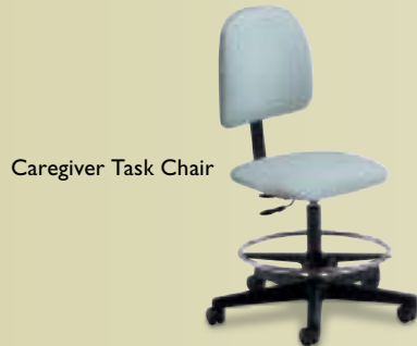
Caregiver Task Chair

Here's the ideal choice for nurse's stations, computer terminals, clinic offices, lab rooms or other applications requiring a higher countertop access.