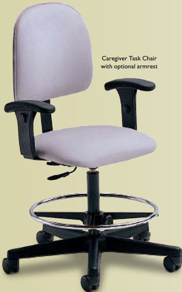
Caregiver Task Chair with optional armrest