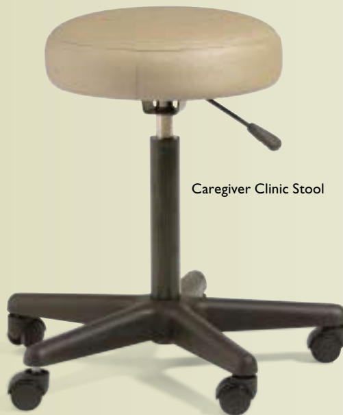
Caregiver Clinic Stool